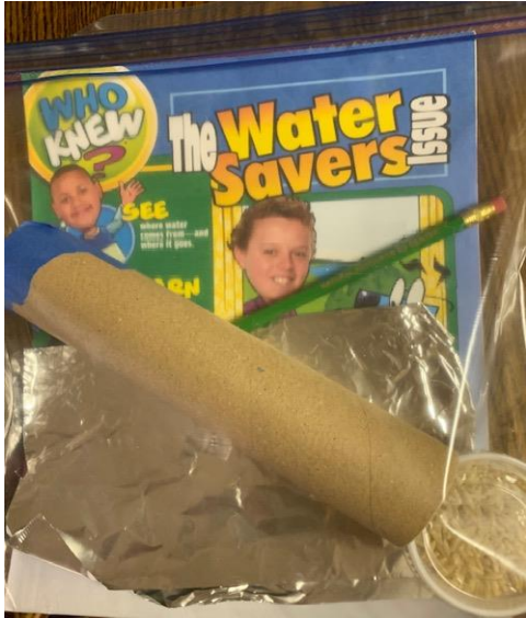
Individual student WOW kit that is delivered to classrooms prior to on-line WOW ZOOM meeting. Kit includes a Water Savers magazine issue, materials for hands on activity (rain stick shown) and a NREC pencil.