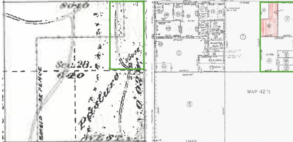
1903 GLO topographic map 1991 investigation parcel map; WFR in red Figure 1: Both maps of Section 28 have a green outline of the East ½ of NE ¼ of Section 28 as listed in the patent