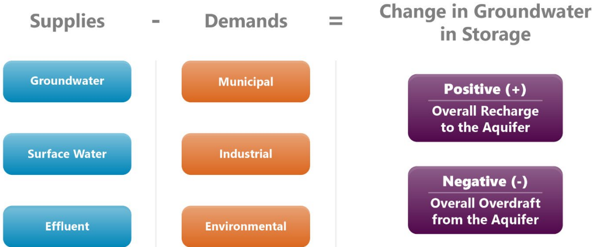
Figure 2. Depiction of the Coconino Plateau Basin water budget, including all available supplies and demands and how they contribute to changes in groundwater in storage.

The SDRs are structured as water budgets, focusing on total inflows and outflows at the basin scale. The SDRs estimate the volumes of water demands from all uses (categorized into sectors of Agricultural, Industrial, Municipal, and Other) and the volumes of water supplies (Surface Water, Groundwater, Effluent, Incidental Recharge, Transportation Water, and Moved Water) available to meet those demands. The reports also include projected demands and supplies under various influences of future scenarios.