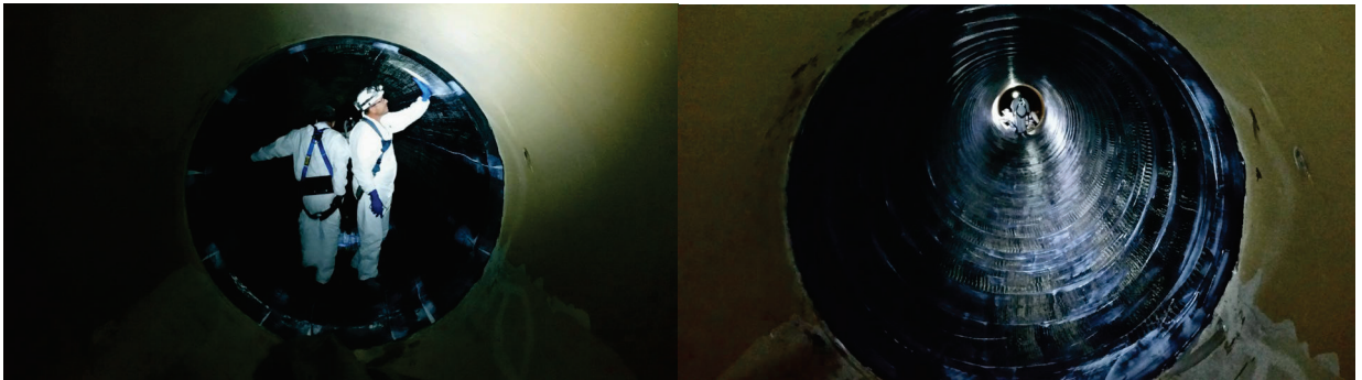
Pipe internal view of a CFRP installation.

By applying a wet layup of saturated fiber impregnated with an epoxy resin at the designed layers and after the curing process, the structural integrity will be renewed 100% with a minimum 50-year life.