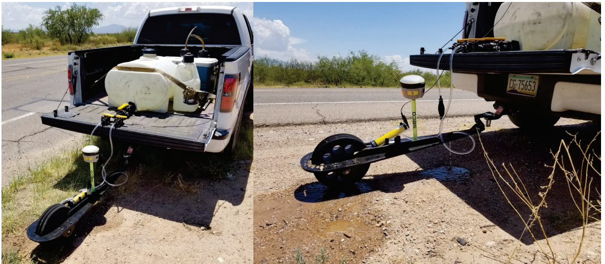
View of the Roto-cell performing a close-interval-potential-survey test.