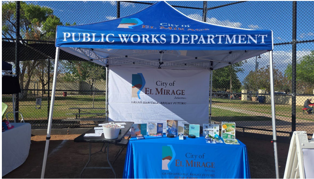
Spring Festival discussing water conservation and FOG.