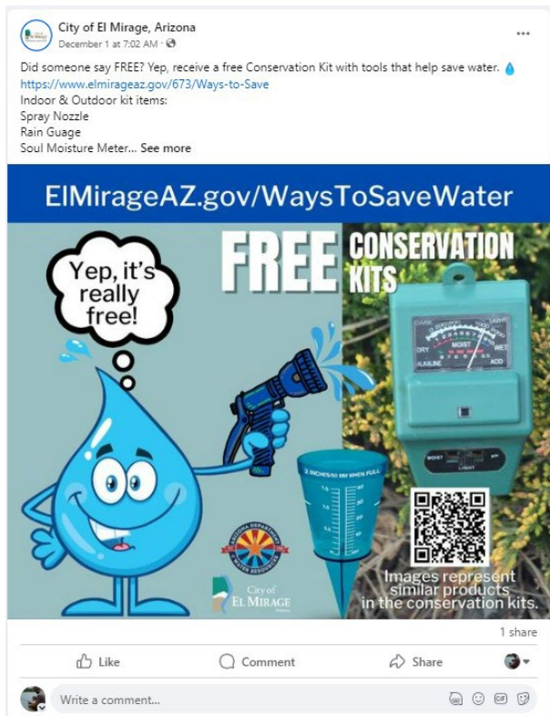
Social media post promoting free water conservation kits.