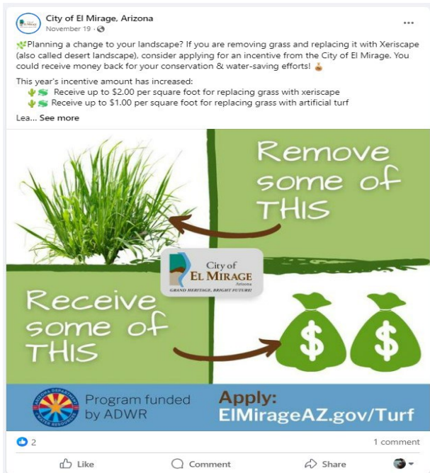
Social media post promoting xeriscape program.