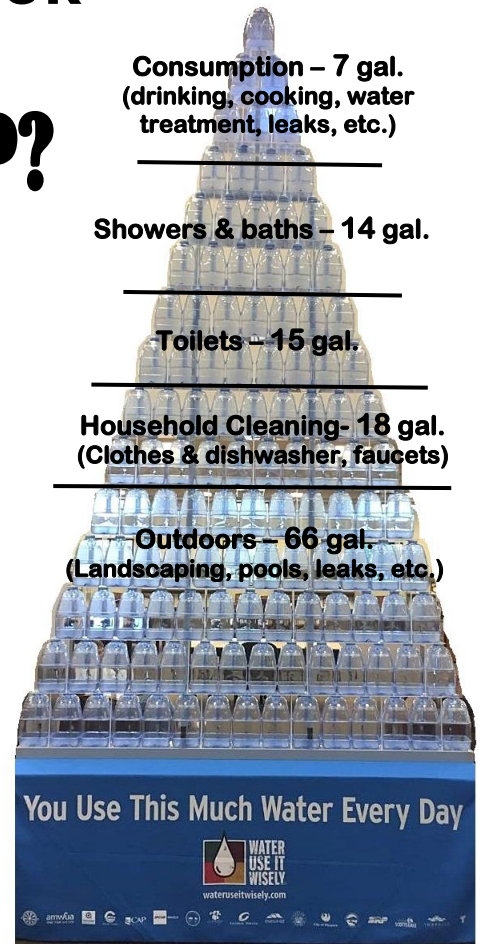
120 gallons used by each person daily

[Hint: your water bill may indicate your consumption in 1,000 gallon units or by CCF's which stands for a hundred cubic feet. 1 CCF= 748 gallons. The chart below gives you examples of how to use each unit of measure]