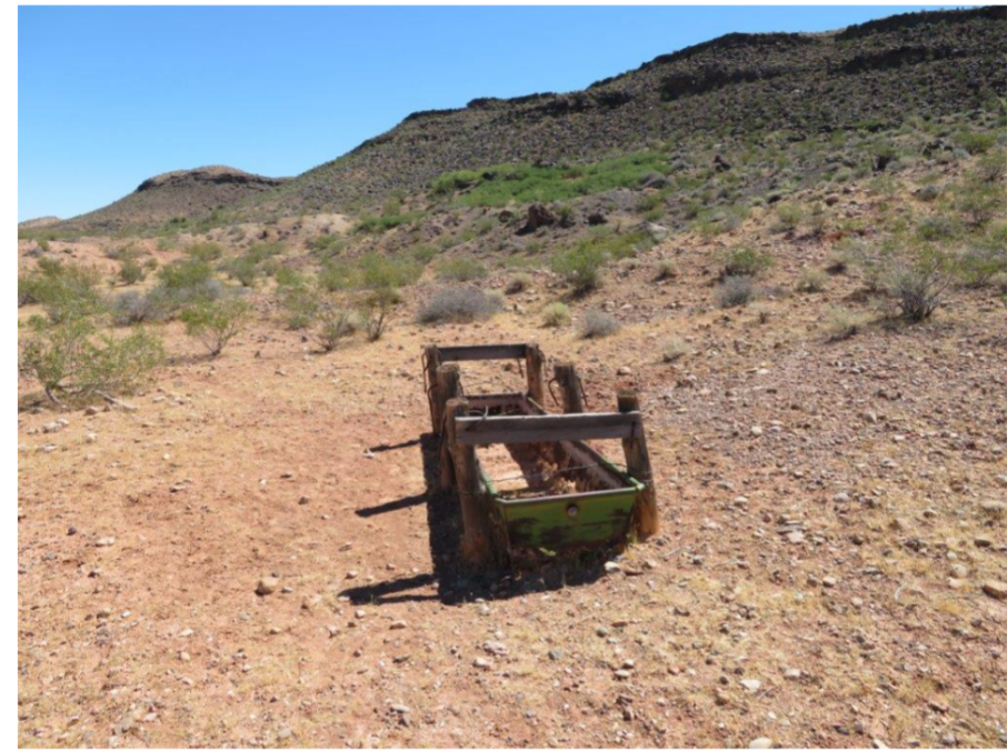
Figure 3- Grapevine Spring Trough (LVT-324)